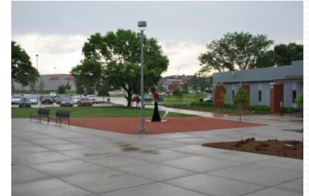
Sculpture to replace "Follow Your Path"