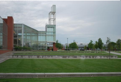
Possible Entry Sculpture

Mahoney, Connector Building, Industrial Training Center, & MCC - Omaha Library